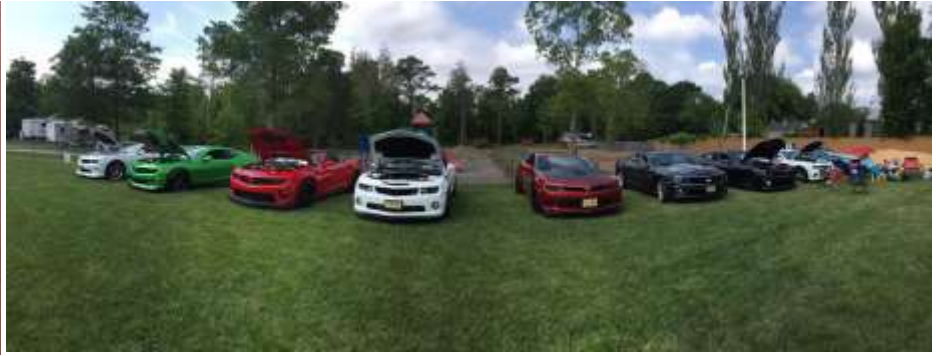
Sea Pirate Campground Show