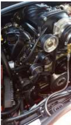
Superman gets a new tensioner