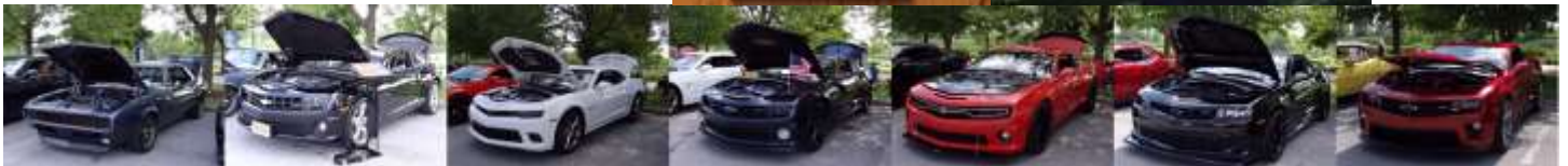
Delaware Riverfront Show