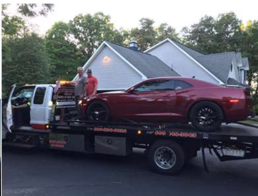
Sometimes life sucks.....Sometimes, all you need is a friend (Rj) or 5! This is what SJCC brotherhood is all about!