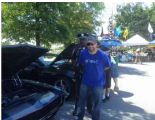
When the cop thinks your reference to "doing a donut" was about him.